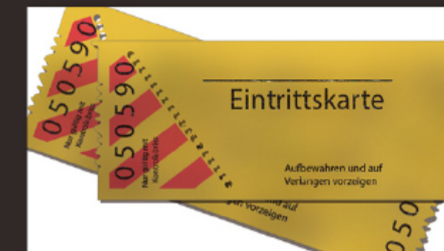
Exhibition Invitation Supported