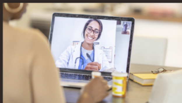
Exhibition Budget Supported