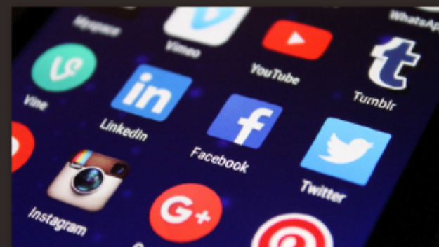
Company & Product Promotion Supported