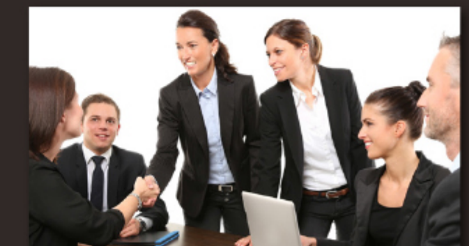
1:1 Matching Service Supported