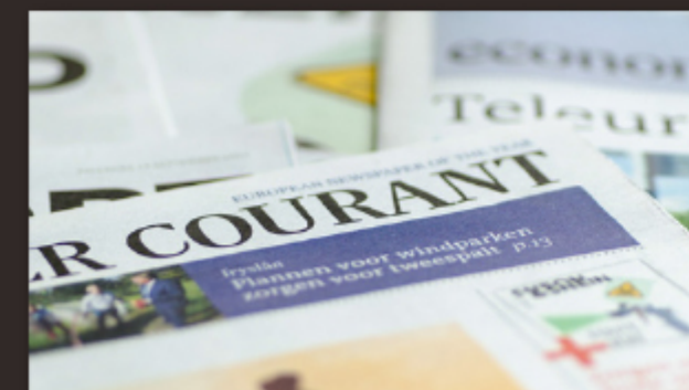
Press Service Supported